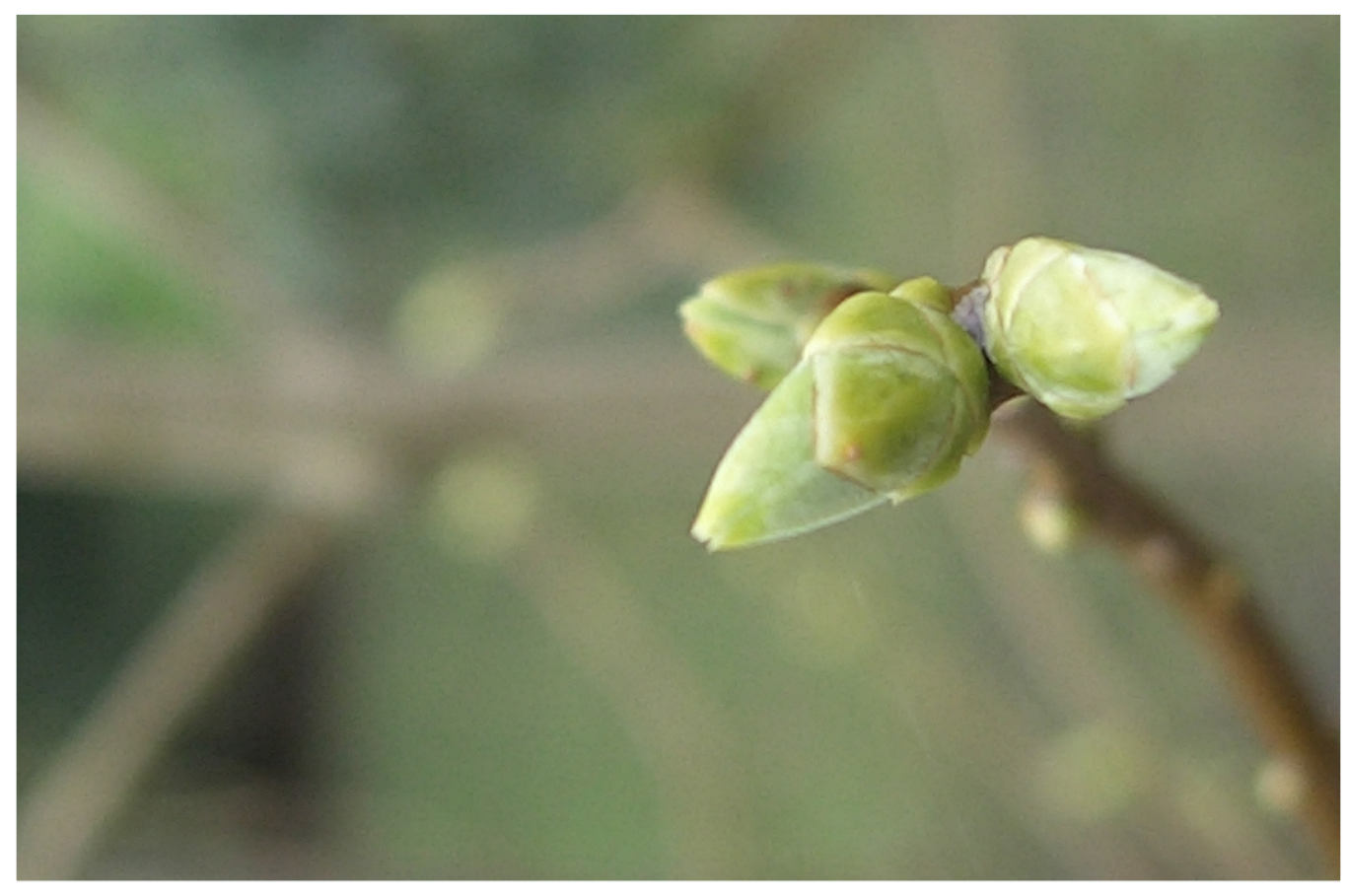
A boxelder basks in the sun on a warm spring afternoon in Austin, Texas.