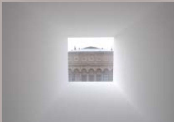
Above: Installation views of Window at Kunsthalle Hamburg, 2000-01.