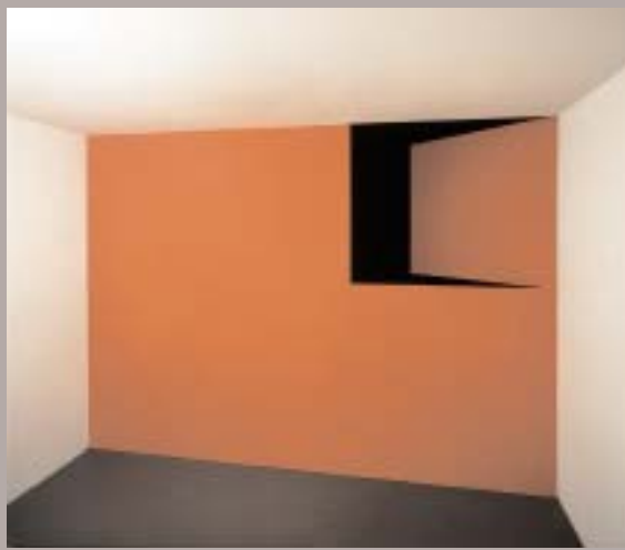
Above and top right: Installation view and schematic drawing of Orange Facade at Galerie Lukas + Hoffmann, Cologne, 1995.