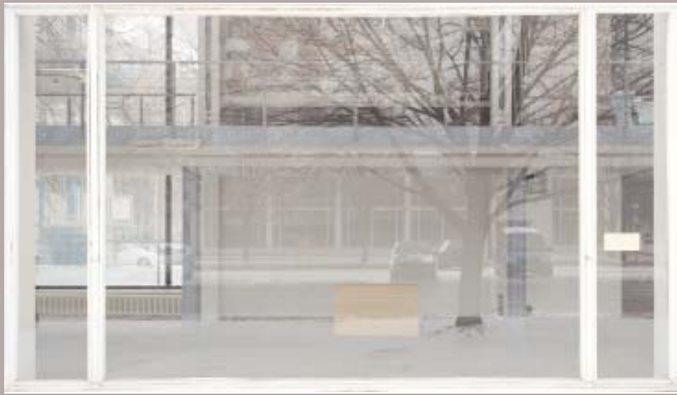
Window III , 2000. Chromogenic color print, 49 x 86" (124.5 x 218.5 cm).

The experience of walking past a storefront window is familiar to us all. We are meant to admire the goods on display behind the window, but we can be equally aware of the glass itself: dirt, fingerprints, and scratches all draw our attention away from the interior of the store to the surface of the plane that separates us from it. In addition, we may notice a reflection of ourselves or of other passersby, so that the windows come to serve as mirrors in which we evaluate hair, posture, or gait. These overlapping images are not particularly difficult to interpret—we instinctively sort out the three and focus on the one we want. Sabine Hornig's photographs capture the nuances of these layers, but compress them into a single image. We are challenged to distinguish between the commercial space, the surface of the window and its frame (the dividing line between interior and exterior), and the reflected streetscape. Hornig's interest in these layers of space is not limited to the image itself: even more important are the reflection of the real (gallery) space on the surface of her images and the role that we, as viewers, play in complicating the interpretation of her work.