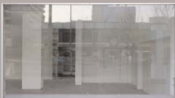
Above: Details from Projects 78 : Sabine Hornig at MoMA QNS, 2003. Color transparencies mounted on glass, each 59 x 101 or 59 x 106 1/2" (150 x 256.5 or 150 x 270 cm). Courtesy the artist, Tanya Bonakdar Gallery, New York, and Galerie Barbara Thumm, Berlin