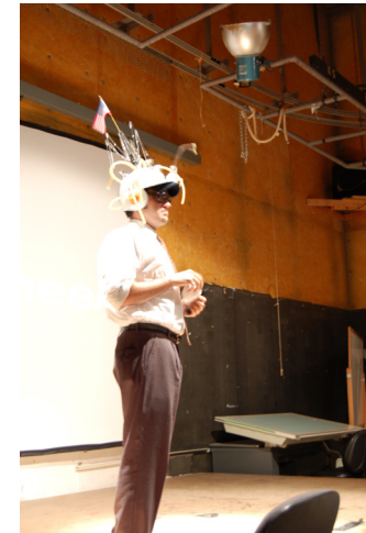
PMP Project 2007