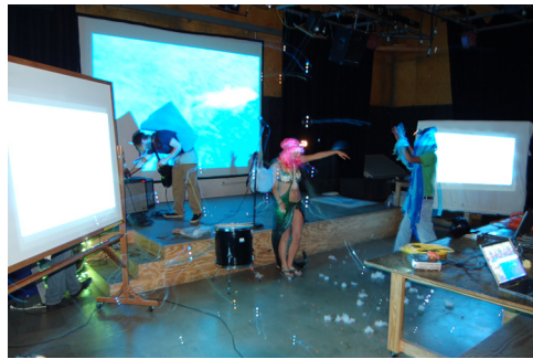
PMP Project 2007